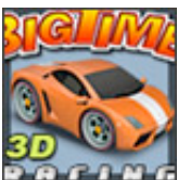
Big Time Racing