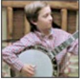
8 Year Old Banjo Player